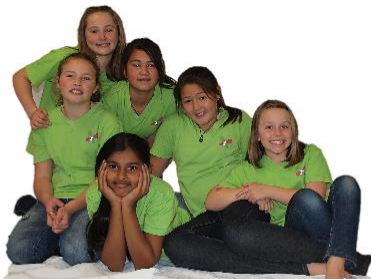
Northpoint girls are the poster girls for our publicity